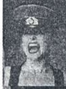
KRISTIN PELUSEK/PHOTO ILLUSTRATION

in gold leaf, graceful lighting fixtures and ornate proscenium arch — a fitting frame for the motorcycles on stage, lights playing up chromed surfaces that ripple like water.